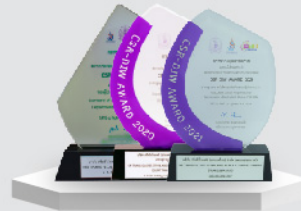
CSR-DIW Award 2020-2021