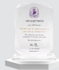
Environmental Governance Award 2019