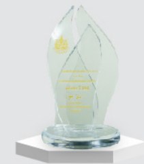
Gold level plaque of honor waste water management 2019