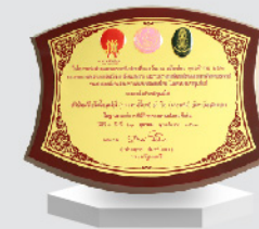
Outstanding Social Activity Award 2020