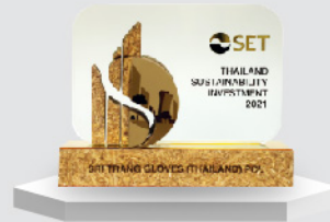
Thailand Sustainability Investment 2021