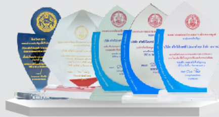
Disability Employment Award 2017-2021