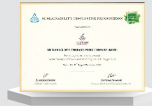
Sustainability Disclosure recognition 2021