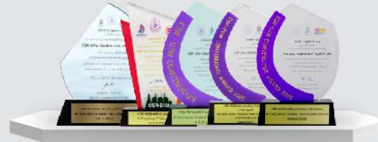
CSR-DIW Continuous Award 2017-2021